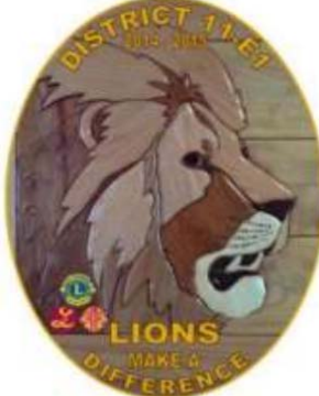
JANUARY SALUTE TO LIONS 11 E1