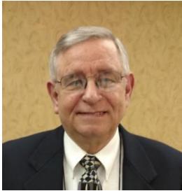
1 ST VDG