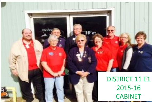
DISTRICT 11 E1 2015-16 CABINET