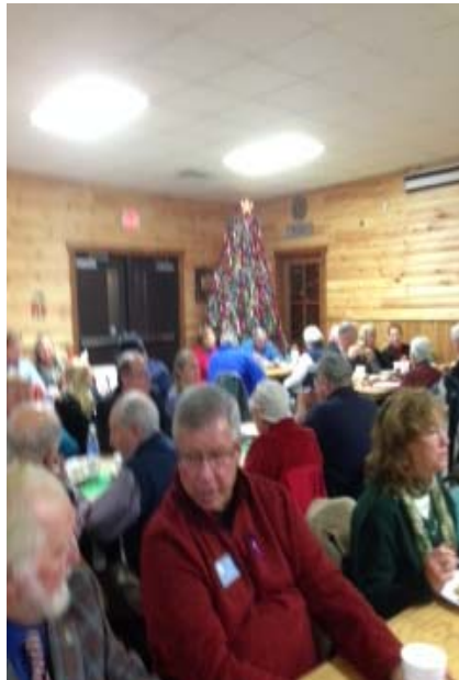
Seventy Five Lions attended a Zone Christmas Party hosted by the Kaleva Lions Club – Bear Lake, Manistee, Mesick and Onkama Lions shared friendship, a wonderful buffet dinner, and music to dance to.