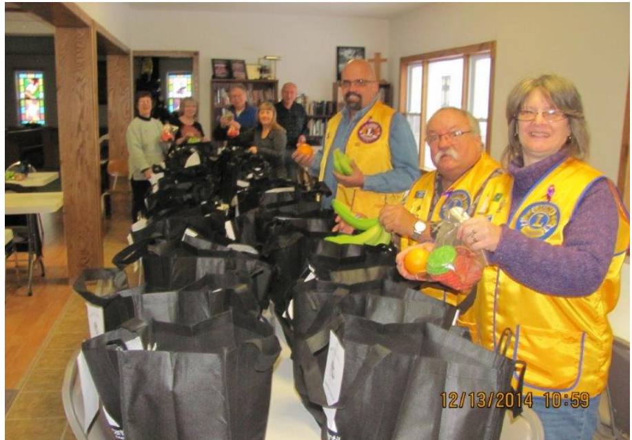
Chippewa Lakes-Mecosta Lions packed Merry Christmas bags for 40 families in the area