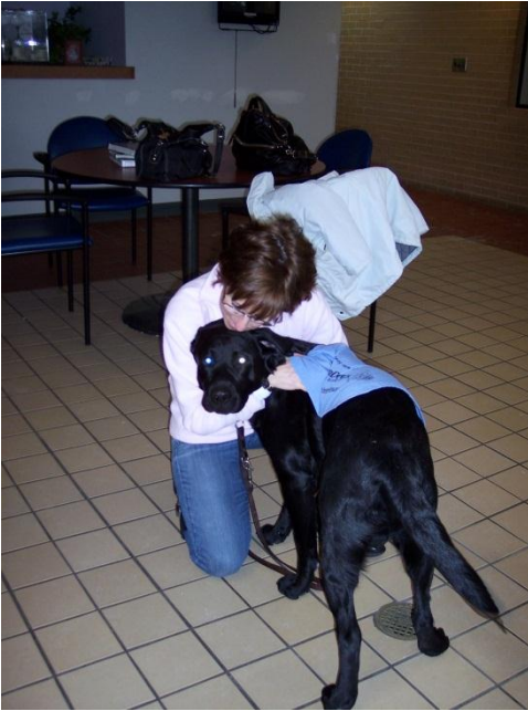
Future Leader Dog Journey