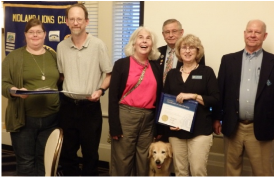
Inducting new Lions