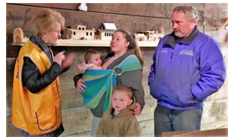
COLEMAN LIONS CLUB

Happy 2018 Fellow Lions I sit looking out into a magical winter wonderland, reflecting on all the great things our Lions do for their clubs, communities, and the district. Clubs reach out further by contributing through LCI. Thank You! Even with several club members enjoying the warmth of a sunny state during the winter months, the Lions at home clubs are bonding together continuing the updates and preparing for spring and summer events. Snowbird Lions remember, try to visit a Lion club in the area you're visiting, how exciting seeing a different club in action. Maybe you will bring back a new idea for your home club. All Lions receive the Lions Pride paper in the mail~Please Read! It keeps us informed of all upcoming events. Lots coming up soon. Clubs I hope you are e-mailing, printing and sharing the district newsletter with fellow Lions. Make sure all club members are receiving or seeing the newsletter, you may be surprised at some that don't. (ask) Clubs are you having fun shopping or asking for donations for your zone basket? Keep working on them but, have fun! Work together. Keep up the great work fellow Lions~Please call , e-mail, or text if you would like me to visit your club.