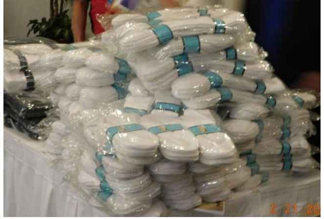
Friday Night Sock Hop Service Project. Lots and lots and lots of socks were donated and collected.