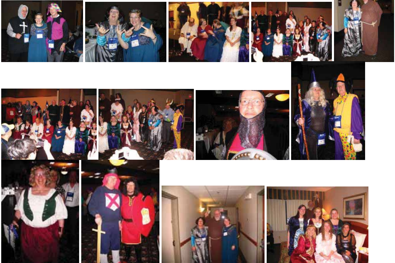
Friday night after costume party