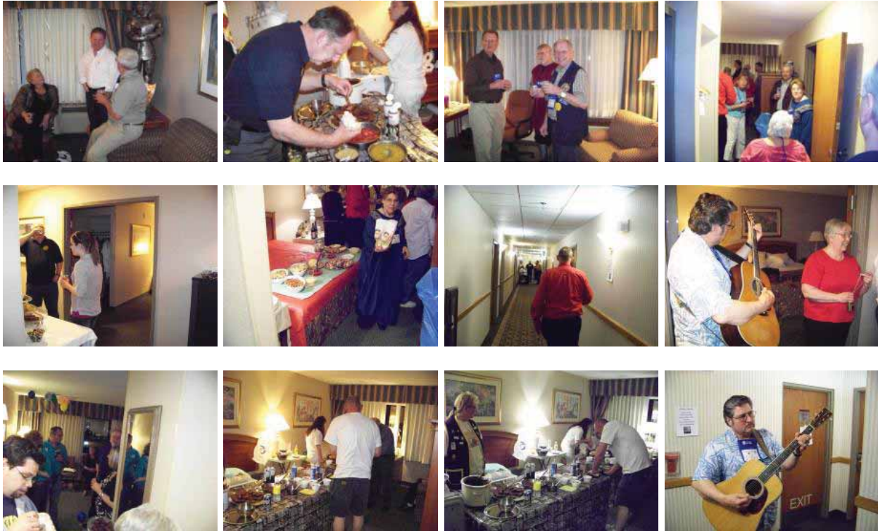
Saturday April 18, 2009