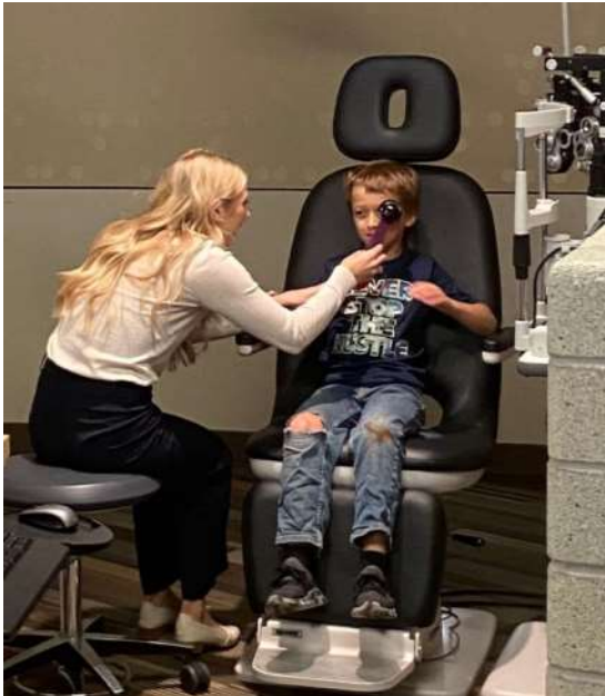
A student receives their medical eye exam from a Michigan College of Optometry senior.

students needing glasses. This year 55 students were examined and 39 received eyeglasses. Twenty of the students needed additional medical follow-up care, so the generous grant from the Fremont area community foundation that was not used for eye exams and glasses will be used for this follow-up care. Some of the follow-up care can be provided by local optometrists while the rest will need to be done at the Michigan College of Optometry at Ferris State University. This program has many partners, including the four school districts and the City of Fremont, which serves as the financial partner because the city has a 501(c)3 designation and they receive the grant funding and dispense it as the program pays its services.