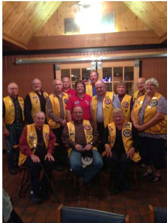
Region 1, Zone 2

Carson City, Edmore, Greenville, Six Lakes , Sheridan, Stanton