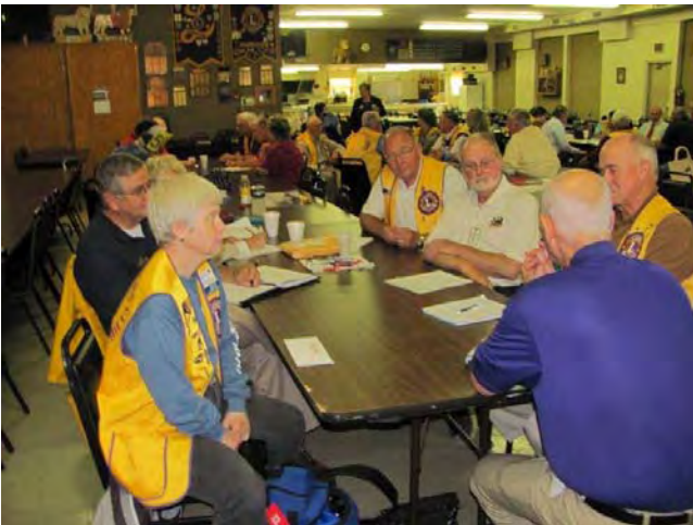
Brainstroming – Fun and Interesting meetings.