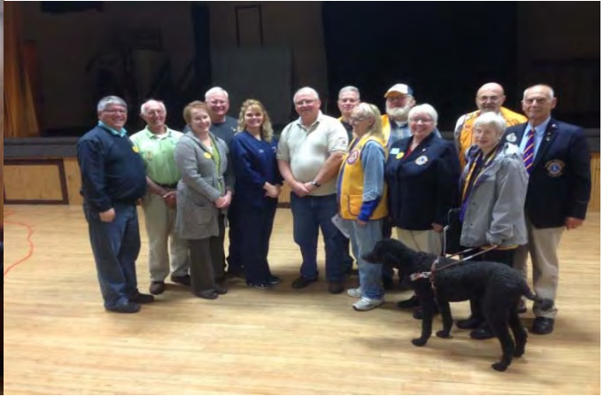
Region 3, Zone 1

Carson City, Edmore, Greenville, Six Lakes , Sheridan, Stanton