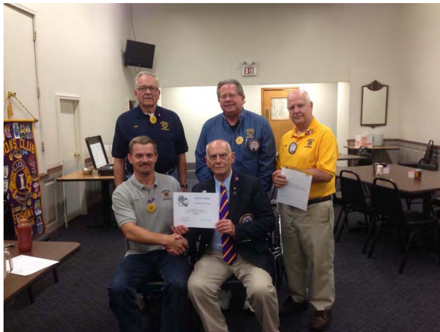
Fremont Lions received certificates representing 175 years of service.