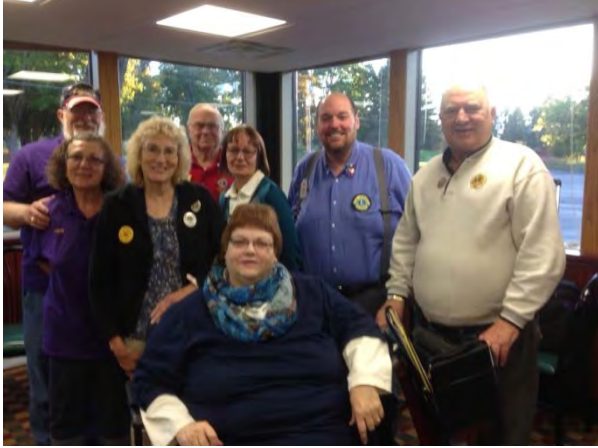
Region 2, Zone 3