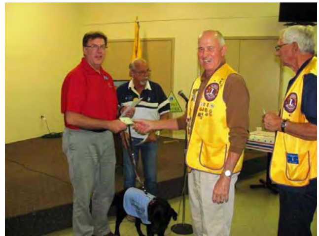
Parade of Checks for State, District and LCIF