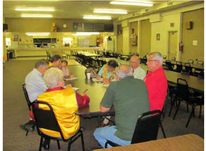
Group planning session.