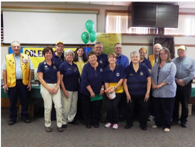
Coleman Lions ready for their annual charter night.