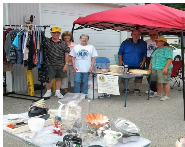
STANWOOD LIONS take a breather during their August garage sale.