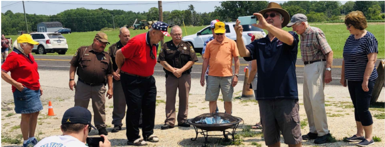
A mask burning was held at Morley Community Center on Saturday, July 3rd to celebrate being outside unmasked.