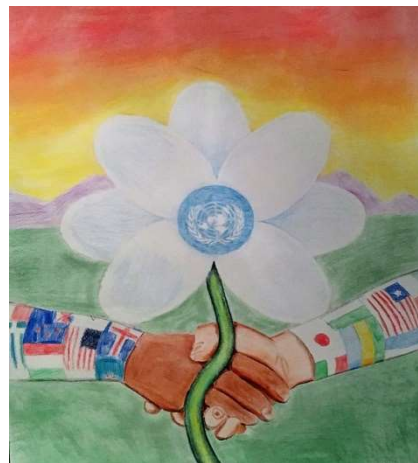
DISTRICT 11 E1 PEACE POSTER WINNER - COLEMAN SCHOOL