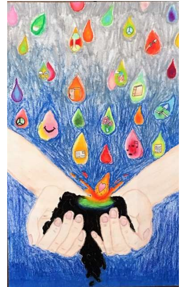
SAND LAKE LIONS TRI-CITY MIDDLE SCHOOL