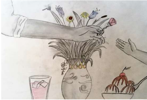
SANFORD MERIDIAN MIDDLE SCHOOL