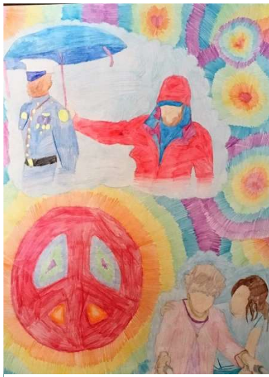
BIG RAPIDS MIDDLE SCHOOL