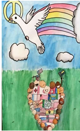
ST. MARY LEELANAU SCHOOL