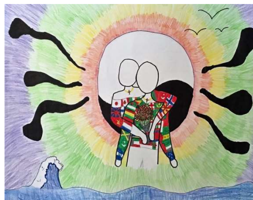
CENTRAL MONTCALM MIDDLE SCHOOL