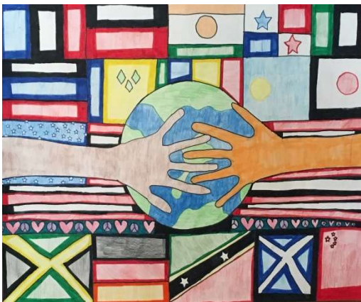
HARRISON MIDDLE SCHOOL