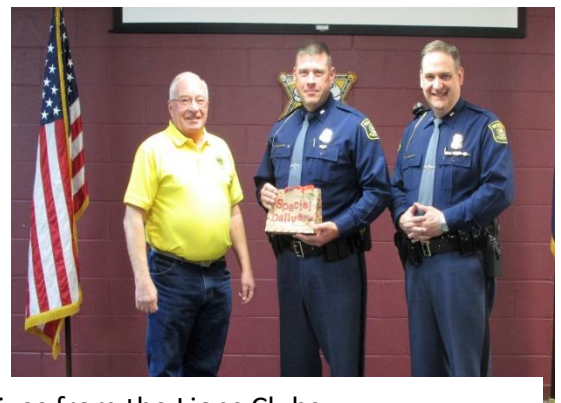
Law enforcement officers and representatives from the Lions Clubs