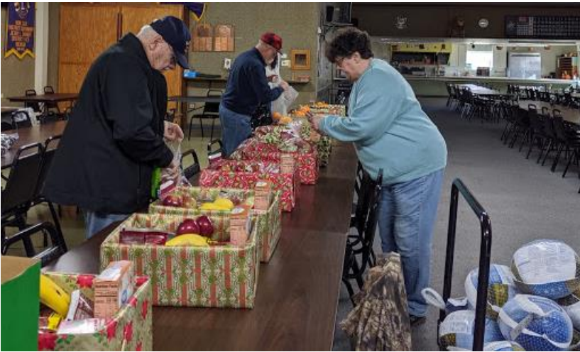
Harrison Lions Club delivery Thanksgiving basket's to our local veterans on November 26, 2019.