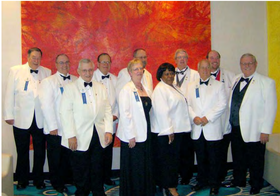
Council of Governor 2013-2014