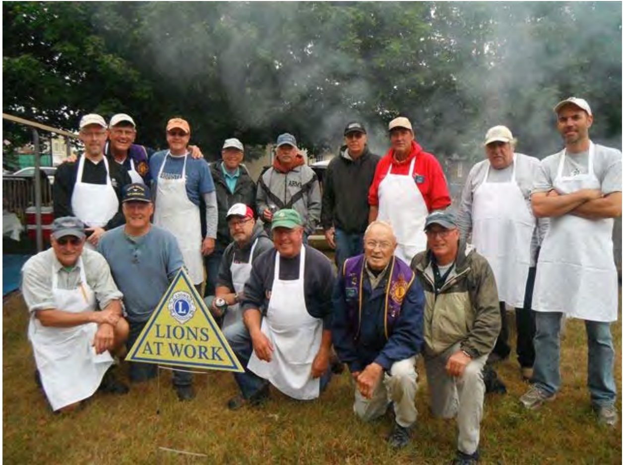
Arcadia Daze Chicken BBQ Chicken Cooking Crew at Arcadia Daze.

The biggest weekend of the summer for us is Arcadia Daze, which is our town's summer celebration/festival weekend. Despite some rain the club's annual Chicken BBQ was a huge success!