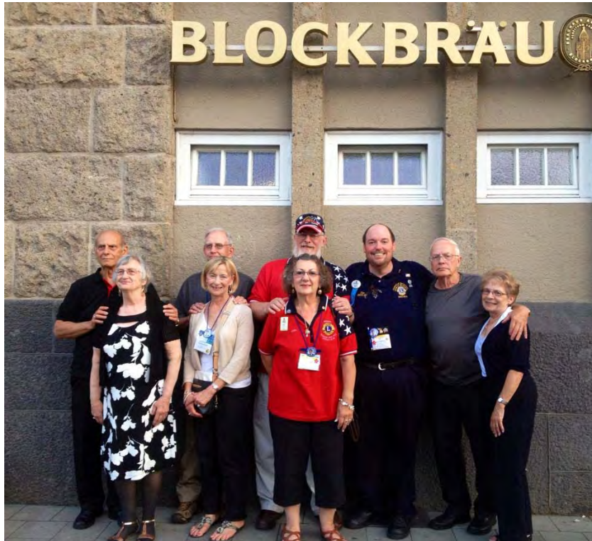
Lions of 11E1 Enjoy Michigan Night Together!