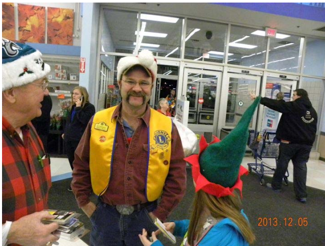
Lion Dan & Lion Bo at the shopping area