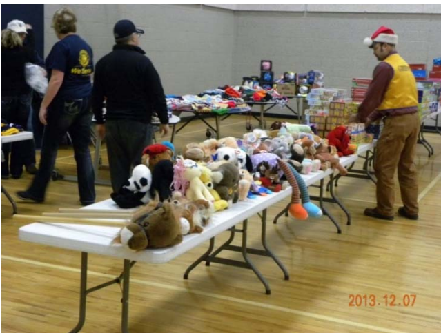
Lions setting up stuffed animals for children