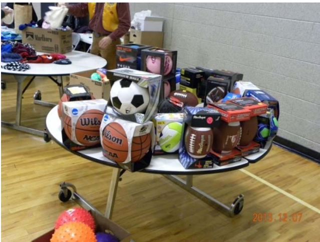
Setting up tables in the school gym