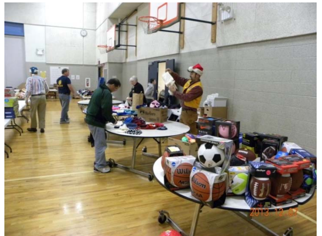
Setting up hats & mittens that were donated