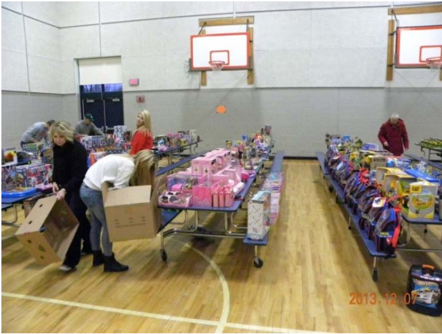
Setting up at the school