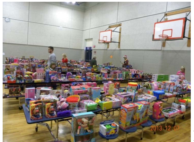
After set-up for all ages of children 1 year thru 12 years