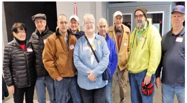
The Midland Lions sponsored and worked the Midland Food Distribution in January at the Midland Ice Arena. Two hundred twenty five families received food.