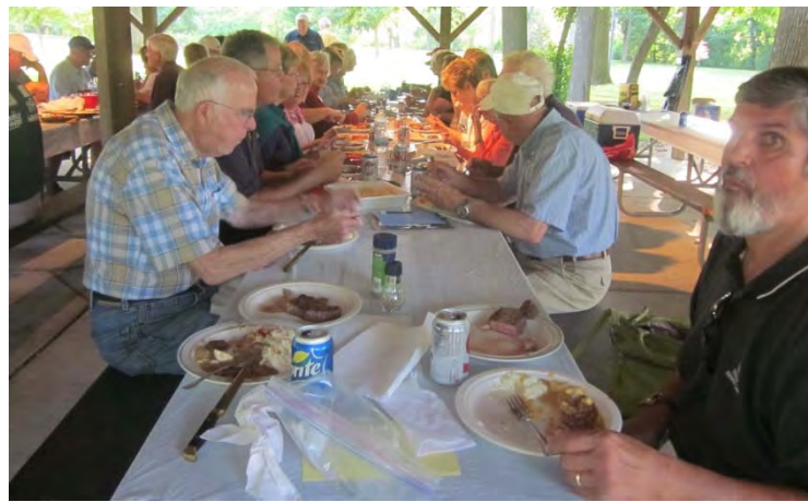
Enjoying a great meal and Fellowship.