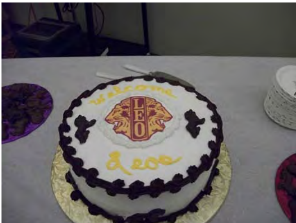
Greenville Leo's Charter night cakes, one of two that were donated. Also served were chocolate Lions.