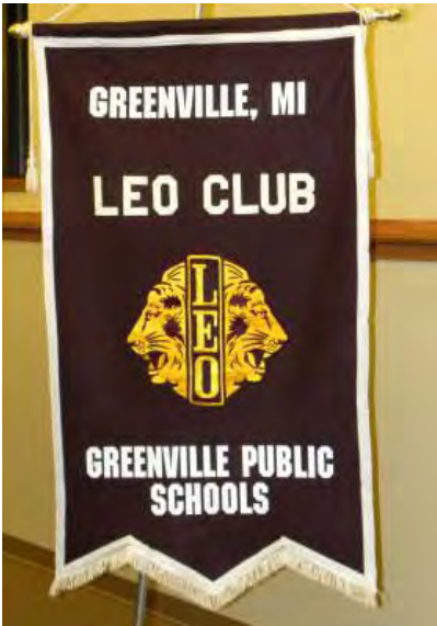
Leo's New Banner