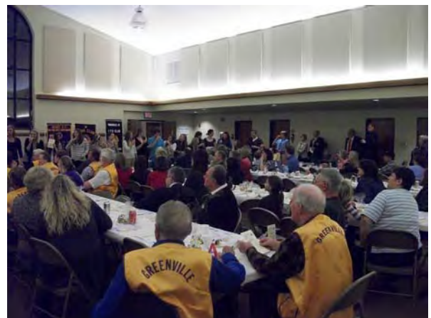
The Leo's were installed as group in front of over 100 Lions, Families and Friends.