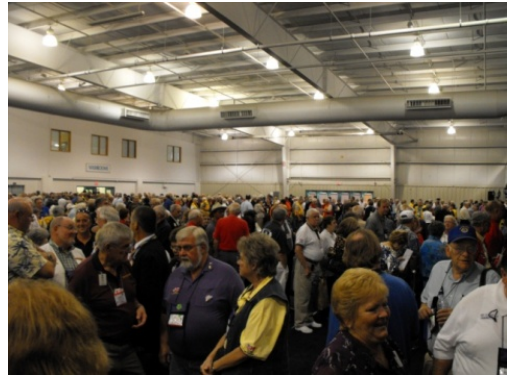
Fellow Lions waiting in line for dinner