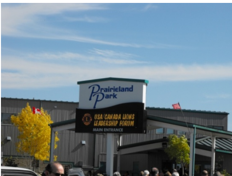
Convention hall at PrairieLand Park Saskatoon

Attached you will find pictures of our trip to Saskatoon, along with some of the many Lions that we met while we were there.