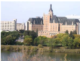
Delta Bees Borough Hotel, Saskatoon