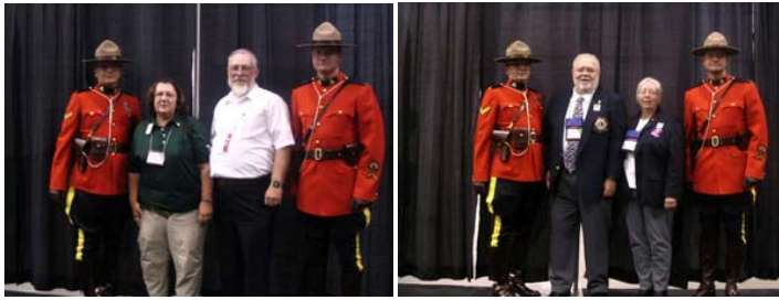
It will be interesting to find out how these two couples were detained and how long they had to spend in the pokey, Canadian Mounted Police, sounds serious to me.