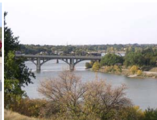
There are 7 bridges in Saskatoon and 5 Railroad bridges as well.

The 2008 USA/CANADA Forum was very well attended. There was a nice contingent from Michigan and Multiple District 11. The Lions of Michigan rose to the occasion by being not only Presenters, but Moderators as well. Saskatoon is known as the "City of Bridges" as it is located along the Saskatchewan River. There is a lot of history in this Western Province and the First Nation people are well respected. We had the opportunity to see where the buffalo were harvested and enjoyed the performance of First Nation members at the Opening Ceremonies. The weather was outstanding and a great time was had by all who were able to attend.