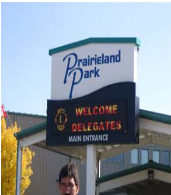
Front of Conference