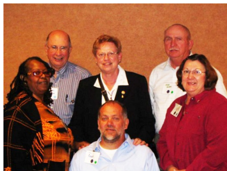
These people were the only delegates at at the Senior Leadership conference in Toronto, Ontario, Canada.