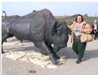
there was some time to look around