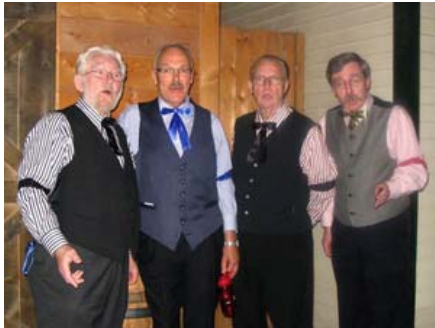
Barbershop quartet performed Friday eve.