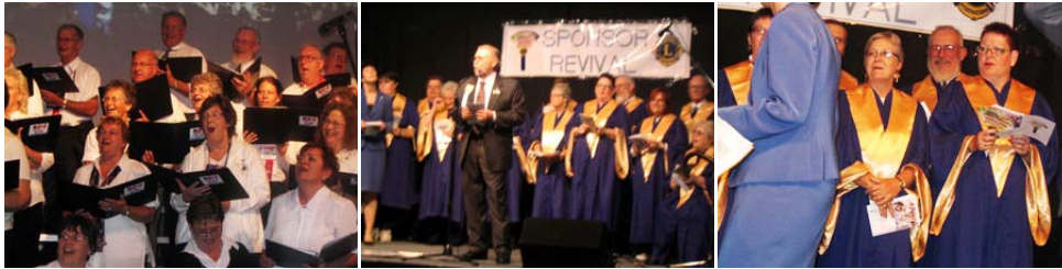
USA/Canada Forum Choir made up of delegates and several from Michigan performed in the Choir.