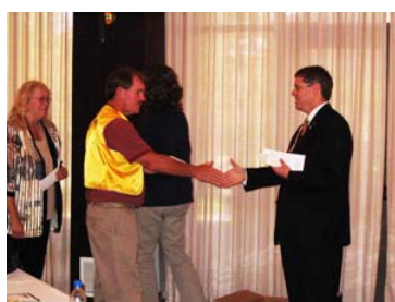
Parade of checks