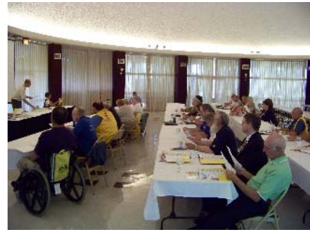
Some of the people at the forum.

On Sept. 27 th the following clubs; Big Rapids, Frankfort, Honor, Vestaburg, Crystal, Greenville, Sand Lake, Chippewa Lake, Lakeview, Weidman, Newaygo, Evert, Cadillac, White Cloud, Baldwin, Mt. Pleasant, Fremont and Sheridan gathered in Big Rapids for the Fall Conference. The Program centered on our State and District Projects. The presenters gave precise and interesting talks about their projects and after they were through talking a parade of checks were presented to each project by the Lions Clubs.