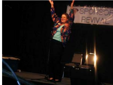
A lady spoke at the Sponsorship Revival