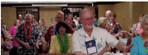
CONVENTION HAWAIIAN NIGHT

If visiting during the week, stop in and visit the Braille and Talking Book Library located near the rotunda. Or, visit the