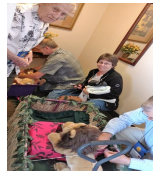
Convention red wagon floats and White Cloud Lions busily assembling their float for the convention parade.