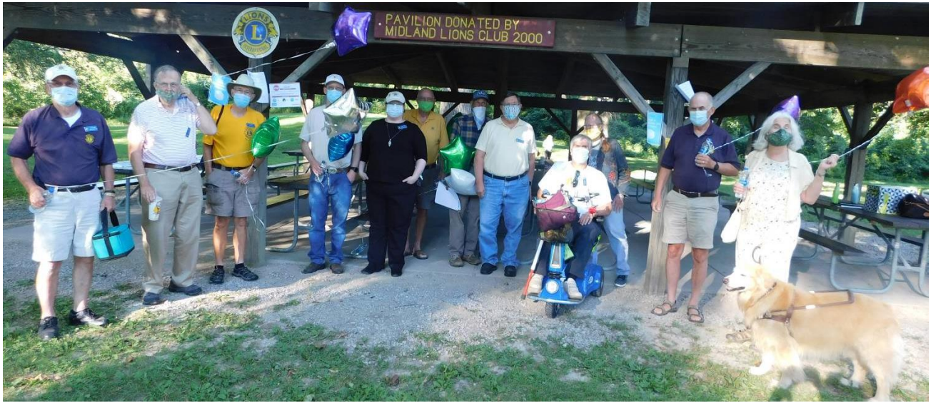
Group picture with our balloons in honor of helium discovery day August 18, 1868.

Midland Lions will continue to meet outdoors for as long as possible. We will be cleaning and sorting eye glasses in September and will be selling Lions of Michigan Foundation 2021 Calendars.