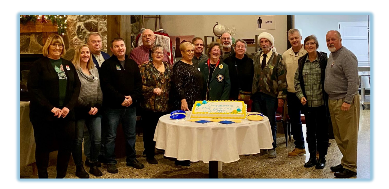
The Hart Club celebrated their 45th Anniversary at their December meeting.