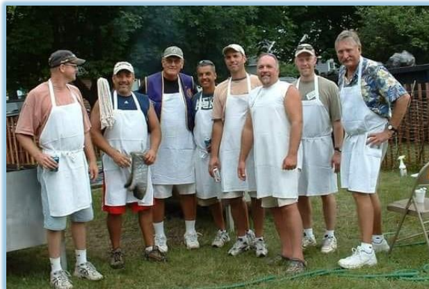
World's greatest barbecue chicken crew!